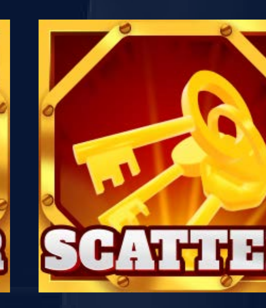
Land 5 Scatters symbols to start the feature with 10 spins.