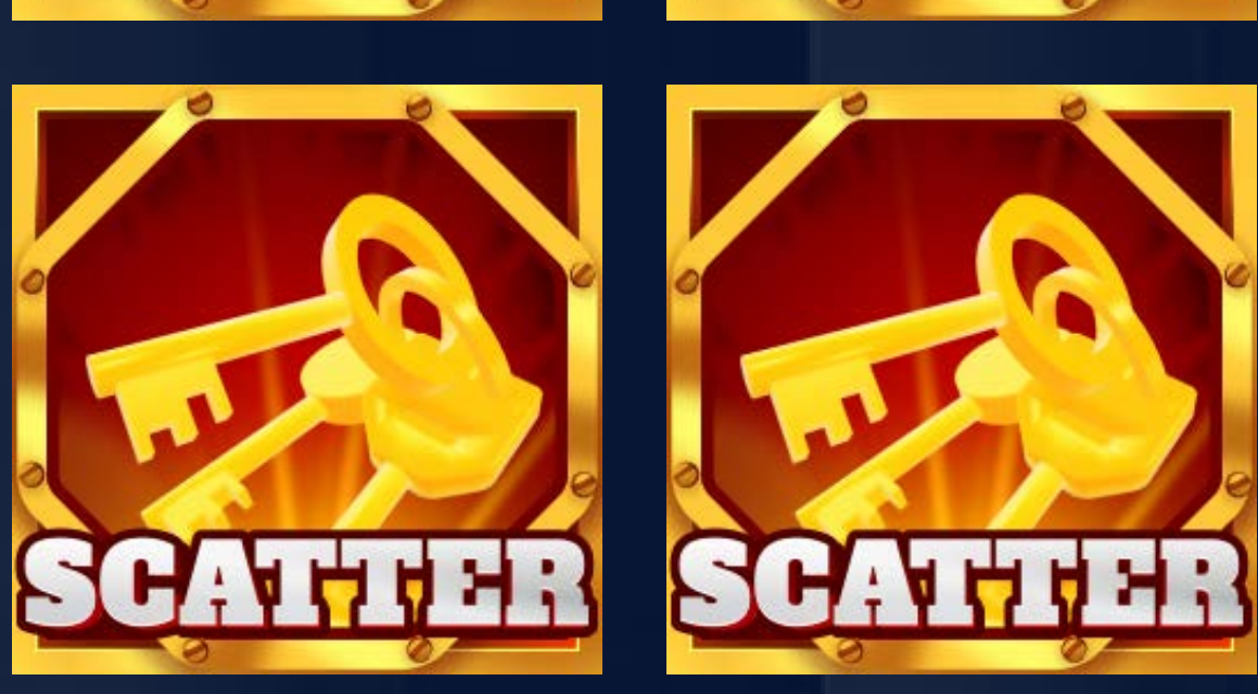
Land 4 Scatters symbols to start the feature with 8 spins.