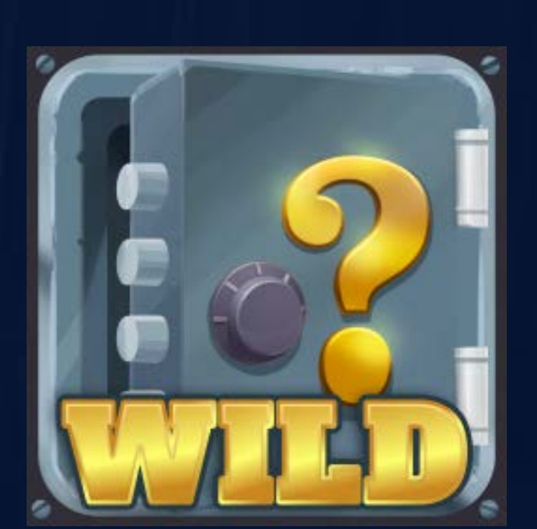
A number from the range: 1 , 2 , 3 , 4 , 5

When a Wild symbol lands, it will obtain one of the following features: